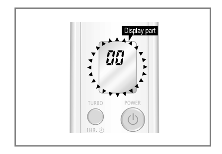
Step 2: Enter the Option Setup mode and select your option according to the following procedure.